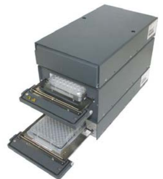
7300003 Incubator MP and 7300013 Incubator Shaker mixed stack