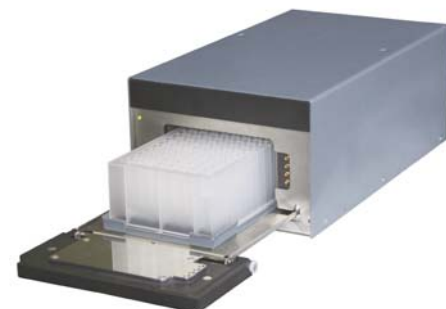
7300006 Incubator DWP

The INHECO Incubators are designed for the use in fundamental research, drug discovery, clinical research, diagnostics and other Life Science applications. They are tested for the operation with an increasing number of established LabAutomation systems, please contact us for more information.