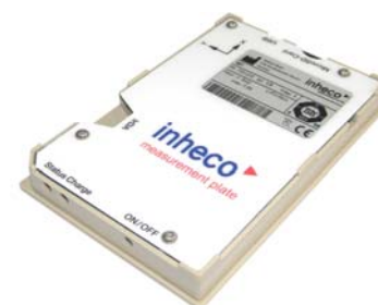
7901000: INHECO Measurement Plate

INHECO offers a compact and precise measurement plate (IMP) in SBS format for verification of temperature and/or shaking performance. The IMP can be used on all INHECO LabAutomation heating, cooling, shaking and incubating devices. We refer to the IMP datasheet for more information.