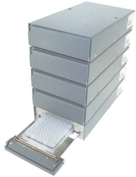
7300003 Incubator MP 5 unit stack

** Data refer to 96 well flat bottom microplate at 15°C ambient temperature