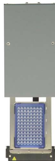
7300003 Incubator MP

The Incubators are plug-and-play high performance devices with CE and UL certification. They are also prepared for use in customer IVD applications.