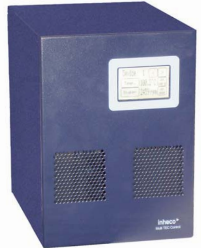
8900030: INHECO MTC

The INHECO MTC is specially created for multiple position TEC control. For single position TEC control units we refer to the datasheet Single TEC Control (STC), which can be downloaded from our website.