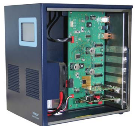
8900030: Easy access to device slots