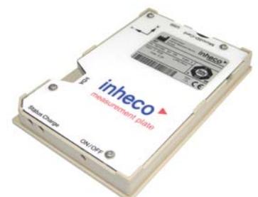
7901000: INHECO Measurement Plate

INHECO offers a compact and precise measurement plate (IMP) in SBS format for verification of temperature and/or shaking performance. The IMP can be used on all INHECO LabAutomation heating, cooling, shaking and incubating devices. We refer to the IMP datasheet for more information.