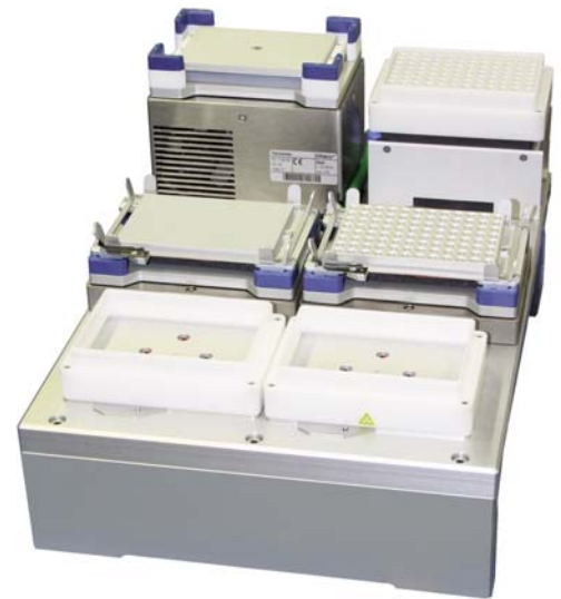
Simultaneous control of up to six different heating/cooling/shaking devices (in this case two CPAC Microplates, two Teleshakes, one Thermoshake and one CPAC Ultraflat)