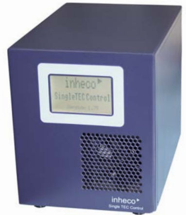
8900031: INHECO STC

The INHECO STC is specially designed for controlling a single temperature controlled position. For multiple controlled positions we refer to the datasheet Multi TEC Control (MTC), which can be downloaded from our website.