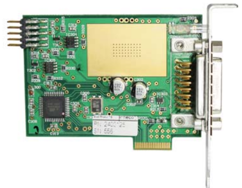
2400125 Device Slot Shaker