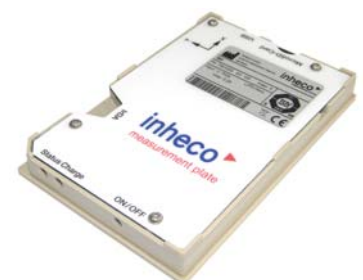
7901000: INHECO Measurement Plate

INHECO offers a compact and precise measurement plate (IMP) in SBS format for verification of temperature and/or shaking performance. The IMP can be used on all INHECO LabAutomation heating, cooling, shaking and incubating devices. We refer to the IMP datasheet for more information.