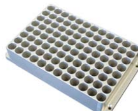
3200267: Micronic Tubes