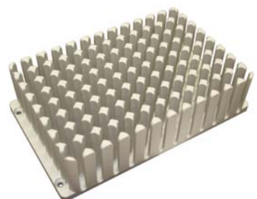
3200333: Deep Well 96