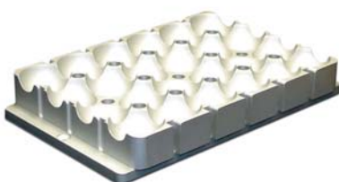
3200286: Uniplate 24