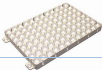
3200245: Round Bottom Plate