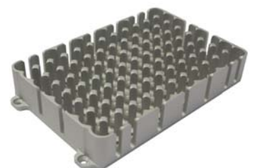
3200334: Half Deep Well 96