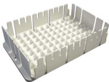
3200309: Deep Well 96

Customized Adapters are available on request.