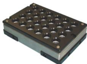
7900031: Tube Rack 24x1,5ml