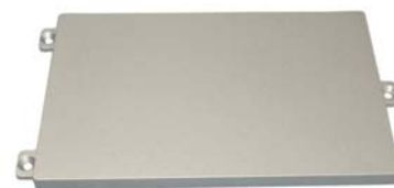
3201087: Flat Bottom Plate