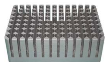
3200239: Round Well Adapter 96