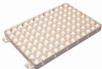
3200245: Round Bottom Plate