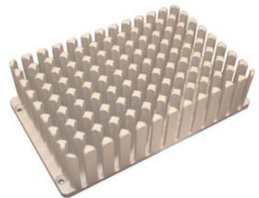
3200333: Deep Well 96