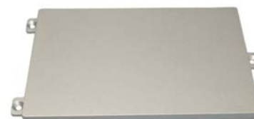
3201087: Flat Bottom Plate