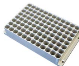
3200267: Micronic Tubes