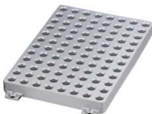
3201085: 96 Pos. PCR Plate