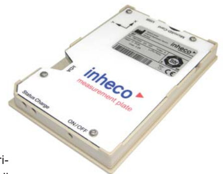
7901000: INHECO Measurement Plate

INHECO offers a compact and precise measurement plate (IMP) in SBS format for verification of temperature and/or shaking performance. The IMP can be used on all INHECO LabAutomation heating, cooling, shaking and incubating devices. We refer to the IMP datasheet for more information.