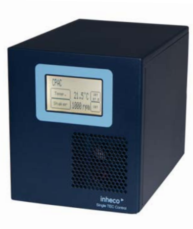
8900031: INHECO STC

The STC can be individually equipped with a controller slot module for either a CPAC, HeatPAC, Heated Lid or temperature controlled shaker device. The device slot can be exchanged easily, giving maximum flexibility. The STC can be either operated manually using the touch screen, or through an USB interface. The soft- and firmware of the controller allows programming of complex temperature and shaking sequences.