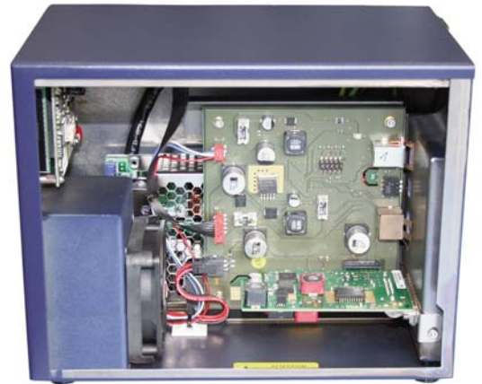
8900031: Easy access to device slot