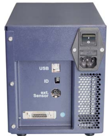
8900031: Backside with 12V Slot installed

For further information on these units, see the relevant data sheets, which can be downloaded from our website.