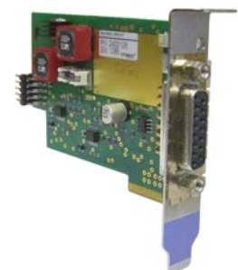
2400128: Slot Module 12V

Product Colour Article No. INHECO heating/cooling/shaking units Slot 12V 2400128 CPAC Slot 24V 2400125 CPAC HT 2-TEC, Teleshake 95, Thermoshake, HeatPAC, Heated Lid