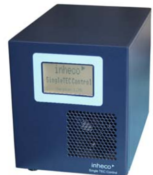
8900031: Single TEC Control (STC)

INHECO offers a compact and precise measurement plate (IMP) in SBS format for verification of temperature and/or shaking performance. The IMP can be used on all INHECO LabAutomation heating, cooling, shaking and incubating devices. We refer to the IMP datasheet for more information.