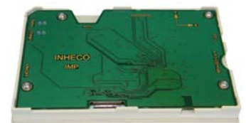
7901000: INHECO Measurement Plate