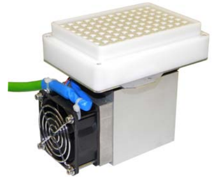
7000179: CPAC Microplate

You can choose between various types of aluminum adapter plates to match the required disposable. A microplate positioner to facilitate precise gripper handling is also available. Adapter plates and positioner can be easily taken down for cleaning or changed to another configuration within minutes.