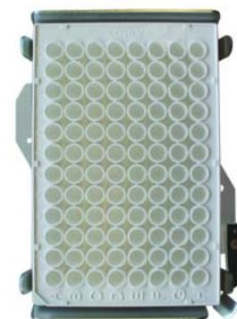
70000179: CPAC Microplate Footprint