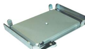
7900016: Adapter Flat Bottom Plate

* Other formats available, see CPAC adapter plates data sheet. Customizing on request