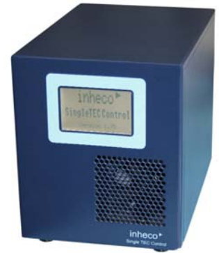
8900031: Single TEC Control (STC)