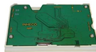
7901000: INHECO Measurement Plate

INHECO offers a compact and precise measurement plate (IMP) in SBS format for verification of temperature and/or shaking performance. The IMP can be used on all INHECO LabAutomation heating, cooling, shaking and incubating devices. We refer to the IMP datasheet for more information.