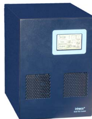
8900030: Multi TEC Control (MTC)

Beckman: Biomek 2000, 3000, FX, NX Xiril: 75, 100, 150 Series Caliper: Sciclone, Zephyr Protodyne: BioCube PerkinElmer: JANUS, Multiprobe II Hamilton: Star Tecan: Freedom EVO, Genesis, TEMO