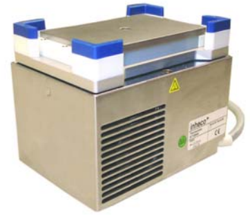
7100146: Variomag Thermoshake