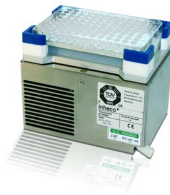
7100146: Variomag Thermoshake

The Variomag Thermoshake can be ordered with two types of precise temperature/rpm controllers: The Single TEC Control (STC) to control a single Thermoshake, or a MTC Multi TEC Control, to control up to 6 units. Both controllers have an integrated power supply, we refer to the respective data sheets. Software and verification tools are available to form a complete thermal solution for all kinds of applications. The unit is a plug-and-play high performance heating device with CE and UL certification. An adapter for Flat Bottom Plates is integrated.