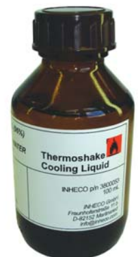
3800053: Thermoshake cooling fluid

* Other formats available, see Shaker adapter plates data sheet. Customizing on request