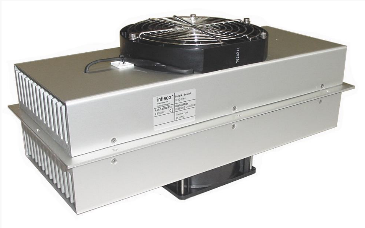
INHECO Part Number: 7200010