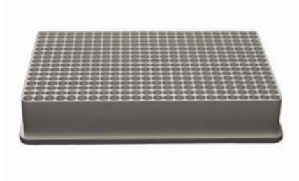
3200204: 384 Pos. PCR Plate