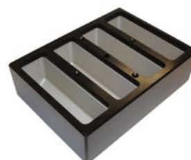
7900040: 4 Troughs