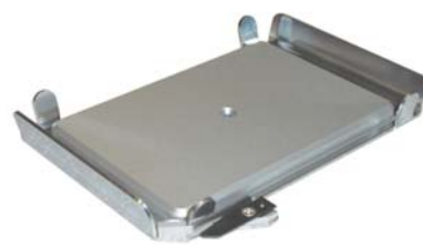
7900016: Flat Bottom Plate