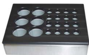
7900024: Tube Rack Multiprobe