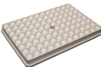
3200279: Round Bottom Plate