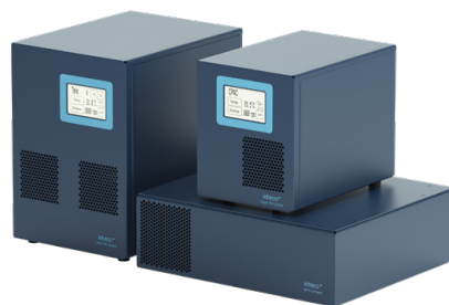
MTC Compact, 8900029

INHECO offers a compact and precise measurement plate (IMP) in ANSI/ SLAS format for verification of temperature and/or shaking performance. The IMP can be used on heating, cooling & shaking devices and inside incubation chambers. Please refer to the IMP brochure for more information.