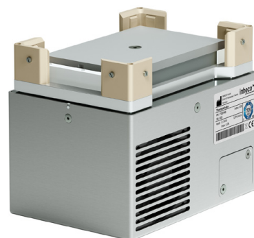
Thermoshake Classic, 7100146

Our shakers are plug-and-play high performance heating & cooling devices with CE and UL certification. An adapter for Flat Bottom Plates is integrated.