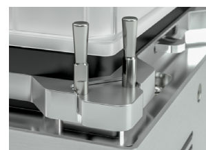
Clamping rods, 7100160