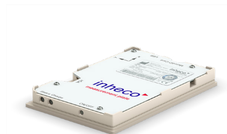
INHECO Measurement Plate, 7901000

** rpm depends on shaker load, max load 500 g