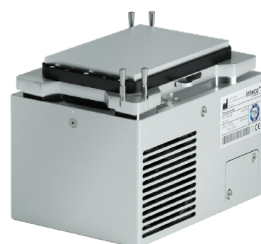
Thermoshake AC, 7100160